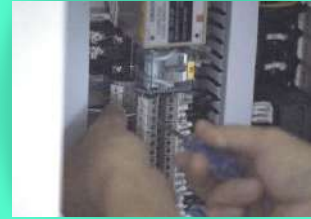
After-sales Training Service