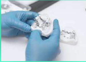
Surface Treatment Services