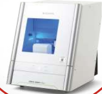
DGSHAPE DWX-52DI PLUS