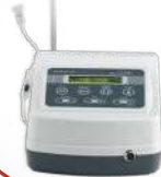
XCUBE IMPLANT ENGINE