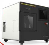
XTCERA X- MILL 500 PLUS