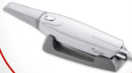
AGKEM INTRAORAL SCANNER 3DS V3 PRO