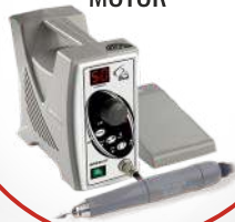
OZ BLACK BRUSHLESS MOTOR