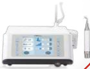
TRAUS SUS20 (OPTIC)