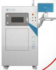
PROFETA C 150