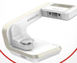
SHINING 3D AUTOSCAN-DS-EX PRO C